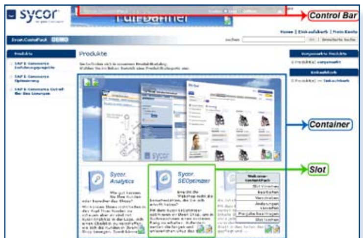
Structure of the Sycor.ContentPack